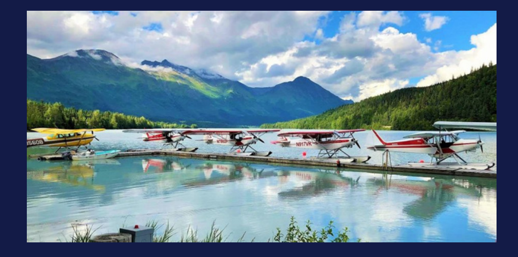
Tickets & Sponsorships